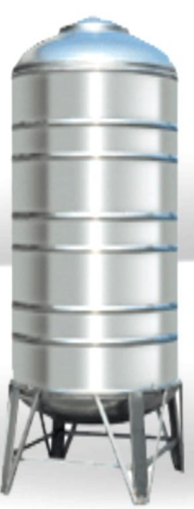
4 Stands Support