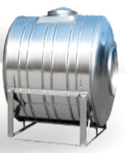
Horizontal Stands Support